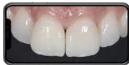
Final result, the dental technician never met the patient