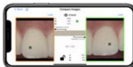
Comparison between the two veneers

Micerium S.P.A. Via G. Marconi, 83 - 16036 Avegno (GE) • Italy Tel. +39 0185 7887 880 • sales@micerium.it www.micerium.com