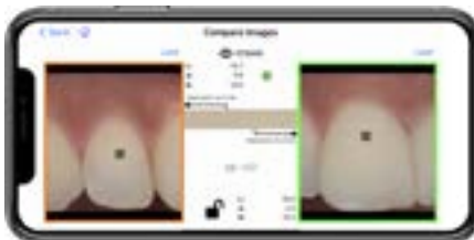
Comparison on the left the natural tooth, on the right the veneer